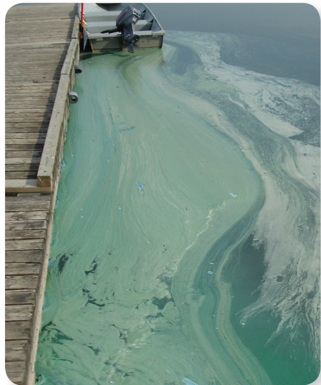
Blue-green algae thrives in warm, shallow, slow-moving water. Blooms are commonly found near docks and shoreline areas.

The Ontario Drinking Water Quality Standard for microcystin-LR (a common algal toxin) is a maximum acceptable concentration of 1.5 micrograms per litre, which is the same as 1.5 parts per billion. It is rare for treated water tests in Ontario to exceed this standard, but precautions should still be taken when a bloom occurs.