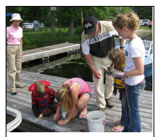
Take it from Uncle Wally, kids -Fish love the juicy worms

Picking the best cup of worms to take for the Kids Fishing Derby provided a great time