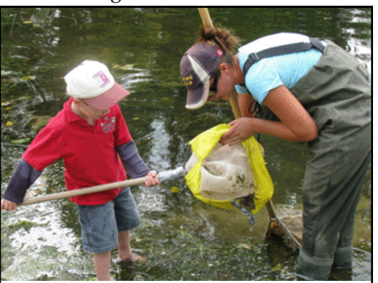
Observing water bugs during Family Environment Day

Otty's Family Environment Day on July 25 saw new and longtime lake residents together for a terrific day. Thanks to the Rideau Valley Conservation Authority, both young and "more mature" participants enjoyed learning about water bugs and how they tell a story about the health of the lake. The kids thought the bugs were fun to watch and catch doing the "water bug dance". We also learned