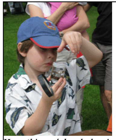
Hey... this one's break-dancing

about invasive species, how to identify them and how to keep them out of our lake. The OPP Marine Patrol was there to answer questions about boating and the law, including what items boaters must carry with them when on the water.