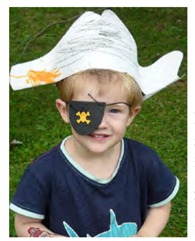
Ferocious Pirate Isaac Haworth