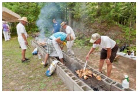
The chicken production line.

After working up an appetite, everyone scrambled to be first to the food. One long buffet table held all the contributions from the gang. Meanwhile a team of smoky chefs had barbequed huge numbers of chicken breasts and legs using Grover Lightford's amazing original chicken recipe. No one went hungry.