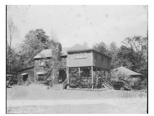
Otty Lake Park hotel. The dance pavilion where Grover Lightford learned to dance is to the right behind the cars

The site where Camp Shomria now stands (plus the land to the east