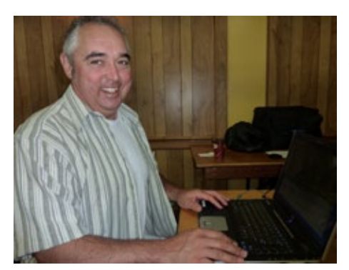
Tiger Tanner operating the audio-visual display console

The AGM closed with door prizes received enthusiastically by the winners: Tay Valley Township T-shirts from TVT, potted shrubs from the RVCA Shoreline Naturalization Program, and a basket of environmentally healthy products from Foodsmiths.