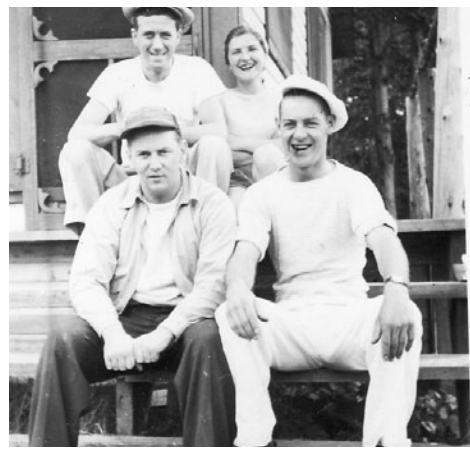
The universal Smiles of fishermen